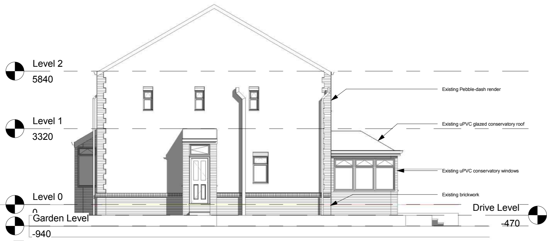
1 South East 1 : 100